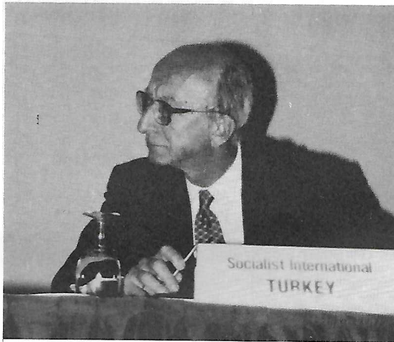
Host party leader Erdal İnönü