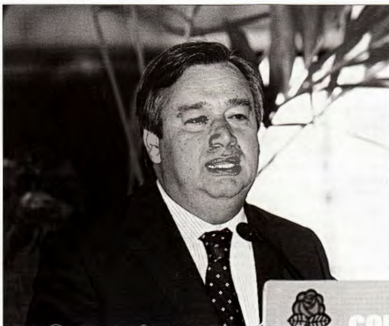
António Guterres, President of the SI

"We know that it is not possible to successfully solve many of the country's problems without the participation of the private sector and the social involvement which comes from non-governmental